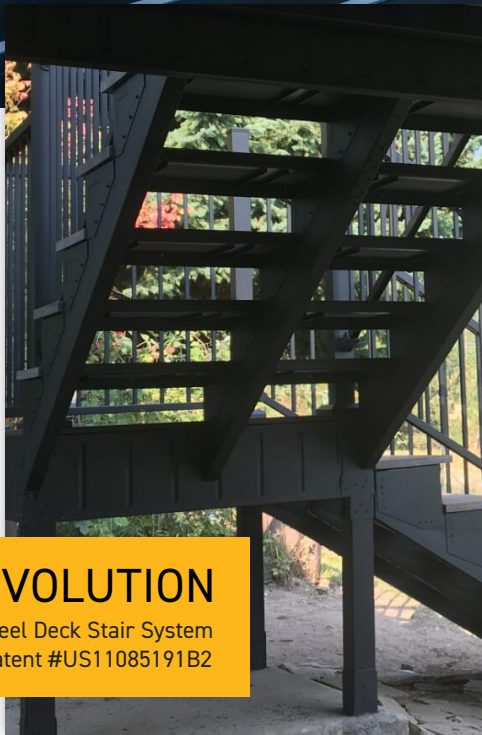
EVOLUTION Steel Deck Stair System Patent #US11085191B2